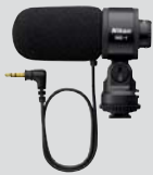
Stereo Microphone ME-1